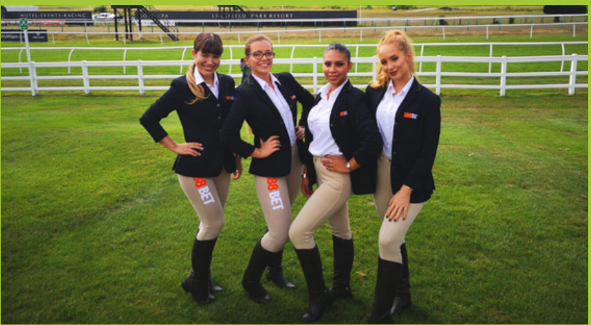
Fancy having a flutter at the races?