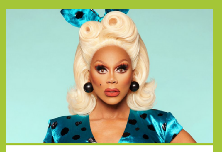
It was no trouble 'dragging' in actors to be audience members for a recent filming of Ru Paul!