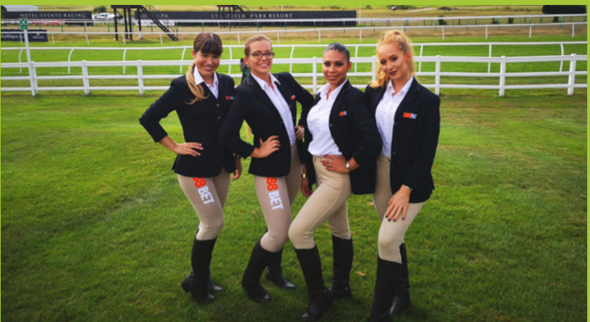
Fancy having a flutter at the races?