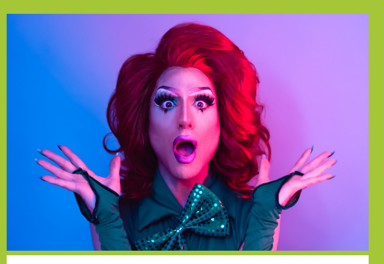
It was no trouble 'dragging' in actors to be audience members for a recent filming of Ru Paul!