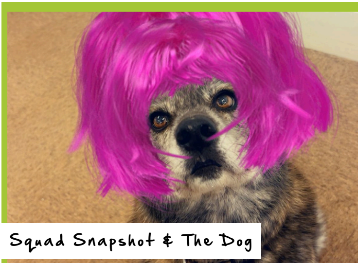
Squad Snapshot & The Dog