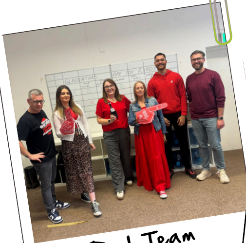
Red Team Triumph!