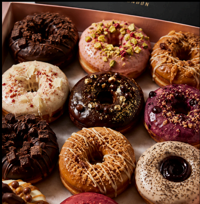
YOU Refer. WE Reward.