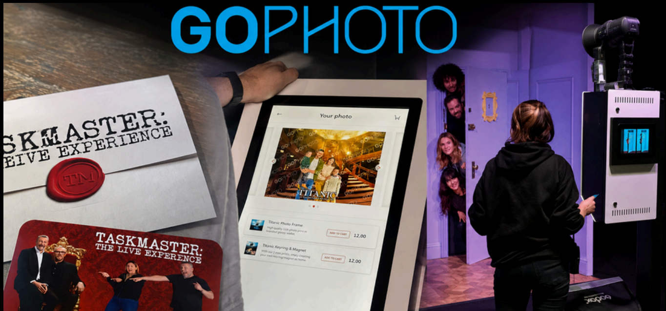
Make Money for ZERO work at your event